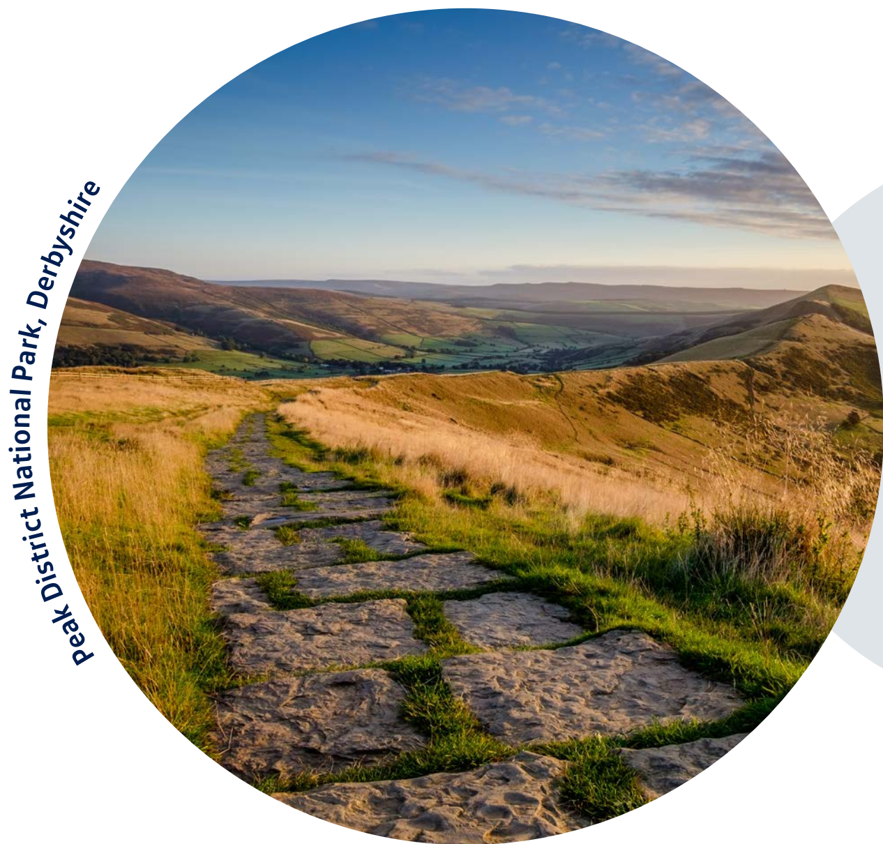
Peak District National Park, Derbyshire