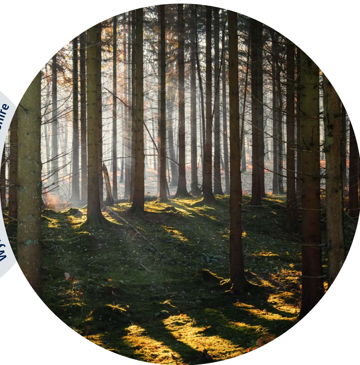
Wyre Forest, Worcestershire

Top Tip: Be aware of mountain bikers who may be using the trail for jumps!