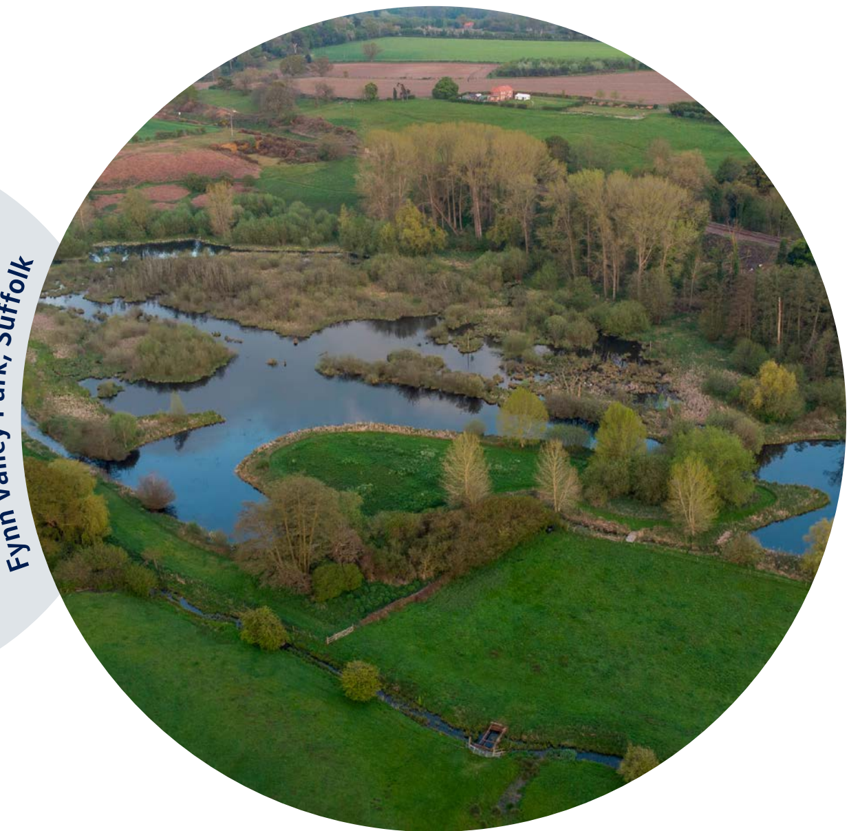
Fynn Valley Park, Suffolk

Top Tip: Be aware that from Spring until Autumn, adders can be active at Dunwich Heath.