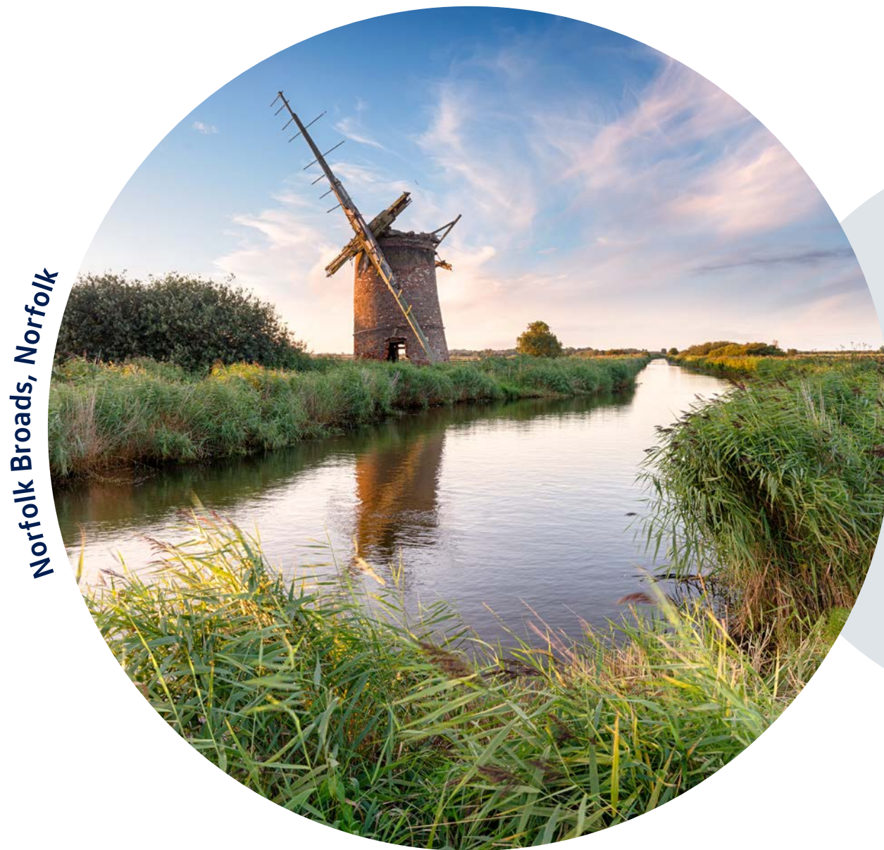
Norfolk Broads, Norfolk