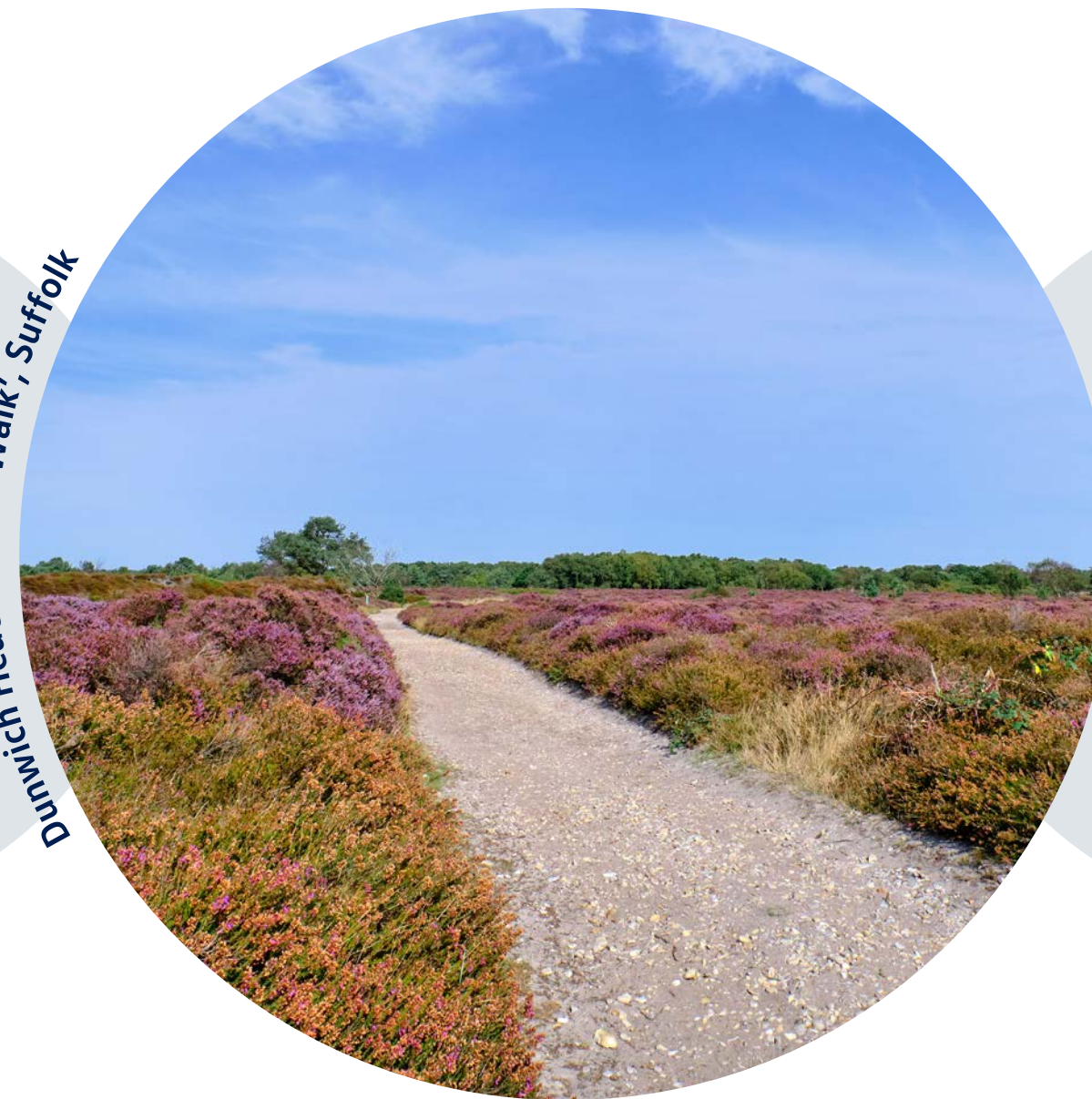
Dunwich Heath 'Woof Walk', Suffolk

Top Tip: From canoeing to wildlife spotting, fishing to good old hiking, there's plenty to discover at the Broads, so make sure to plan your visit in advance.