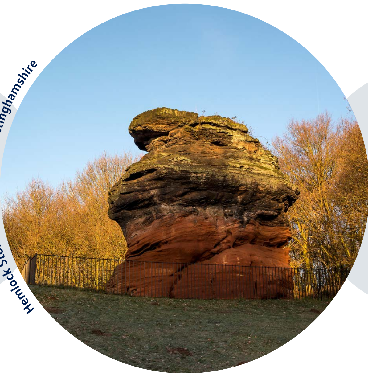
Hemlock Stone Circular Walk, Nottinghamshire

Top Tip: A wide array of wildlife can be seen at the park, including the only English population of mountain hares, as well as red deer – so make sure to keep an eye on your four-legged friend.