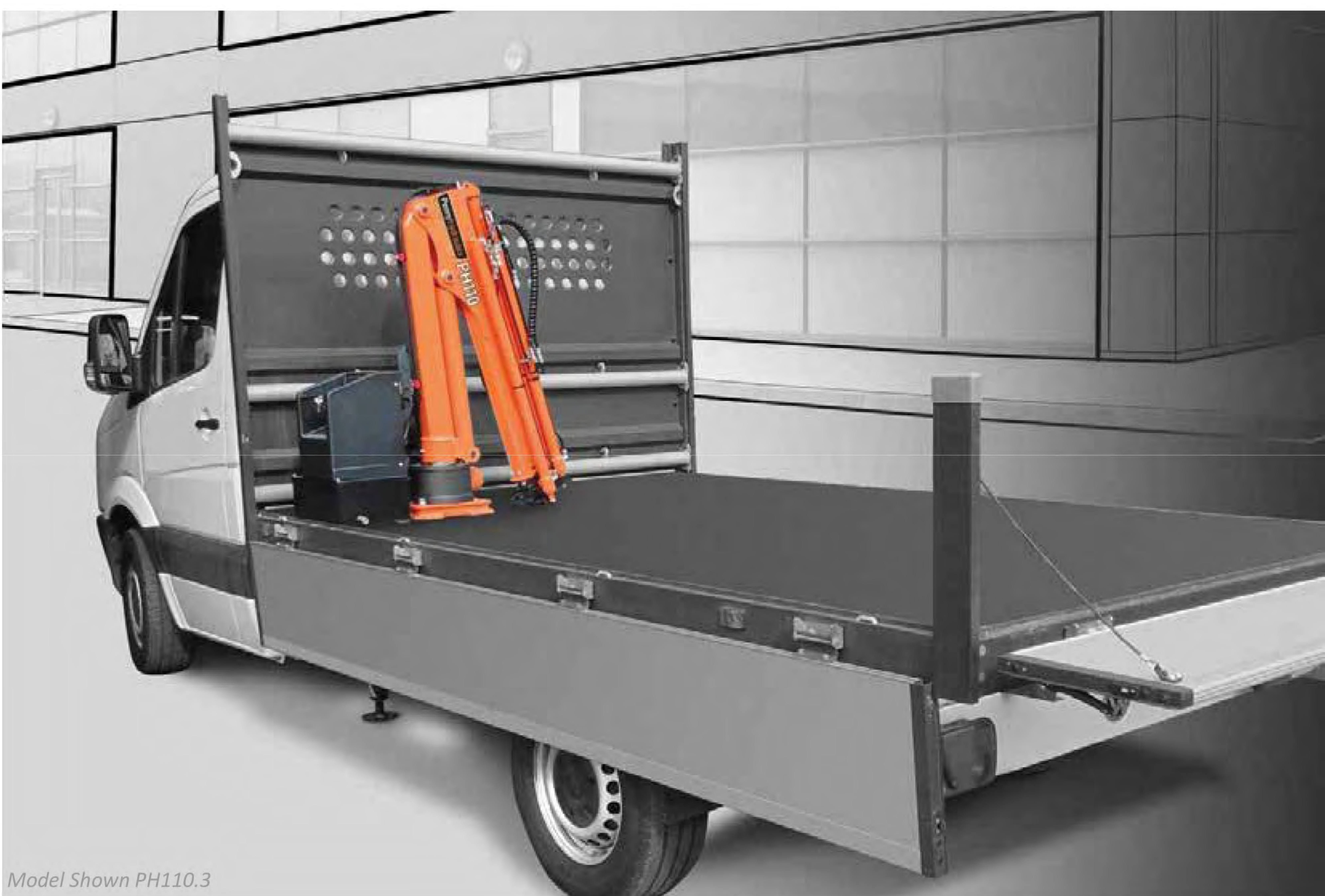
Model Shown PH110.3