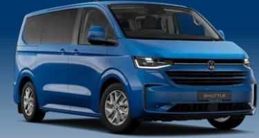
TRANSPORTER SHUTTLE LWB 2.0 TDI 150PS Minibus Style Auto LCV