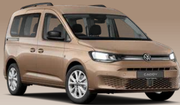
CADDY MAXI 2.0 TDI 122 Life 5dr DSG [Assistance Pack] MPV