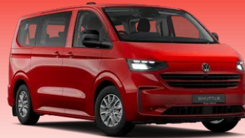
TRANSPORTER SHUTTLE 2.0 TDI 110PS Minibus Life LCV