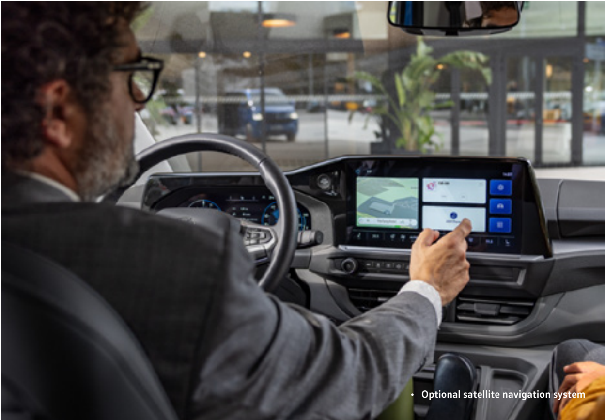
• Optional satellite navigation system

Detailed information regarding tyre efficiency labelling and technical specifications on all potential tyre fitments can be found by visiting the Volkswagen Commercial Vehicles online car configurator at www.volkswagen-vans.co.uk/en/configurator.html